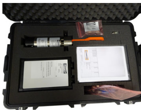
The ClampOn WTM kit in carrying & storage case.