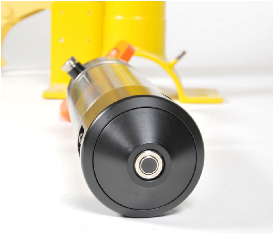
ClampOn Subsea WTM (Wall Thickness Monitor).