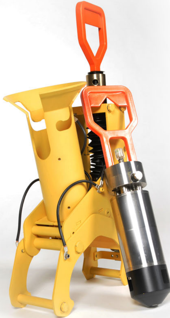
ClampOn Subsea WTM with optional retrofit installation bracket.