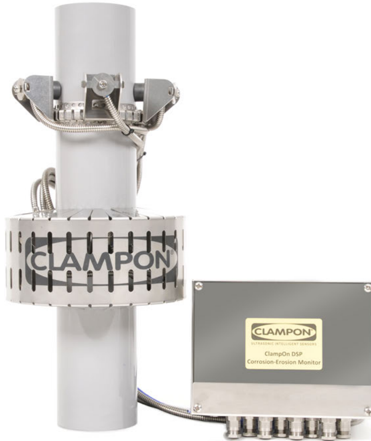
ClampOn topside CEM ® with transducers on pipe.